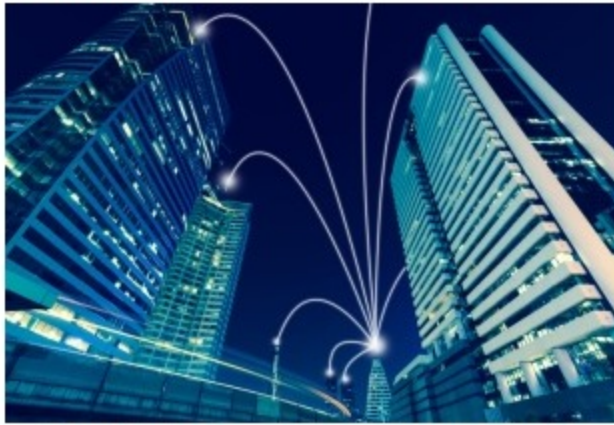
Airbus CyberSecurity and its partners have developed the smart secured building system.

The research and technology project FUSE-IT, conducted by 18 partners from France, Belgium, Portugal and Turkey and led by Airbus CyberSecurity, has received the 2018 ITEA Award of Excellence on Innovation